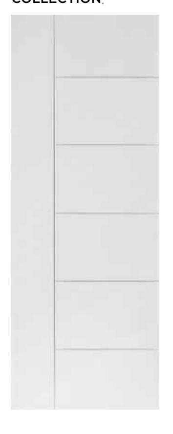
Embrace the beauty of minimalism with the sophisticated, streamlined look of embossed lines.