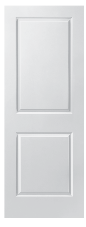
Add a defining element to any space with familiar designs that offer timeless appeal.