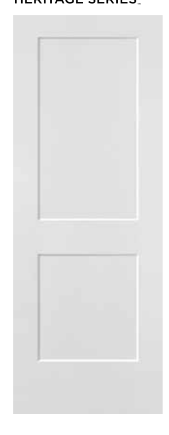
Celebrate traditional craftsmanship with clean lines that blend seamlessly with their surroundings.